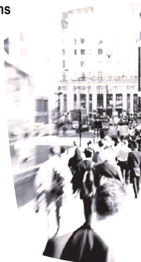
The event was sponsored by Ferguson Partners and the book is available through ULI's website.

The panel discussed issues including the strategic landscape and operating implications facing the industry, the biggest unknowns going forward and how to manage against them, and how one positions an organization to take advantage of the situation in Europe.